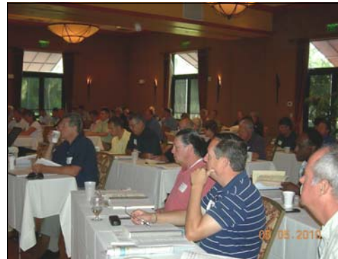
Chapter offering held at Pelican Preserve, in Ft. Myers, FL