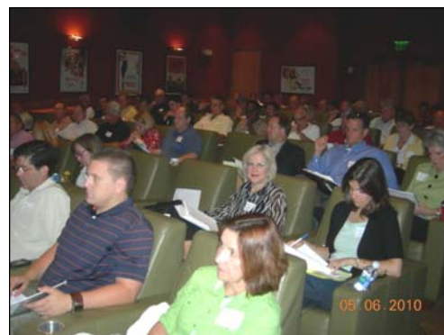
Florida Law seminar with 70 students in attendance