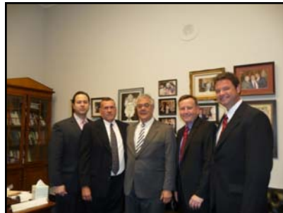
Rep. Barney Frank with South Florida Chapter LDAC attendees