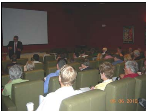
Seminars held in Ft. Myers